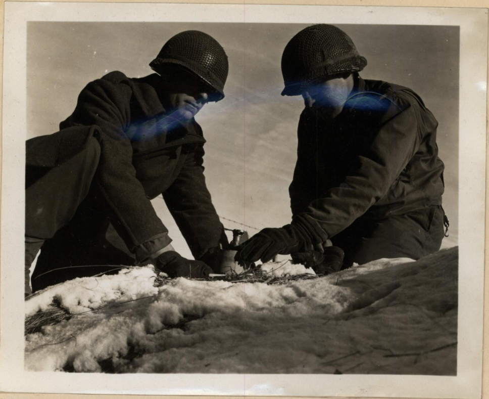
30TH DIVISION SECTOR: NORTH OF MALMEDY, BELGIUM. "A" COMPANY LAYS A LARGE AP MINEFIELD AS PART OF V CORPS BARRIER PLAN. BRITISH SHRAPNEL MINES WERE BURIED IN FROZEN GROUND.