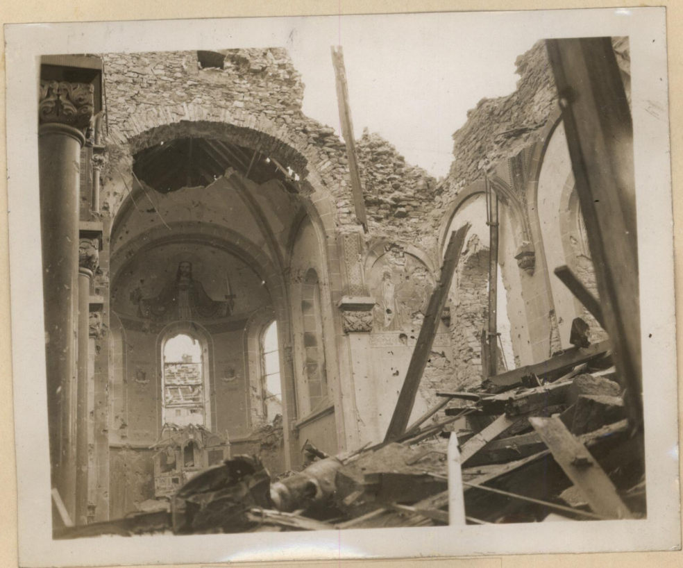
CHURCH IN HURTGEN

Sheet 3 of 6 sheets to Inclosure No. 5, AFTER ACTION REPORT December, 1944