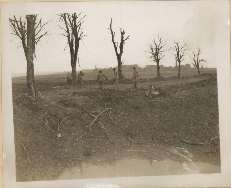
FILLING CRATER ON ROAD TO HURTGEN: "B" COMPANY

Sheet 2 of 6 sheets to Inclosure No. 5, AFTER ACTION REPORT December, 1944