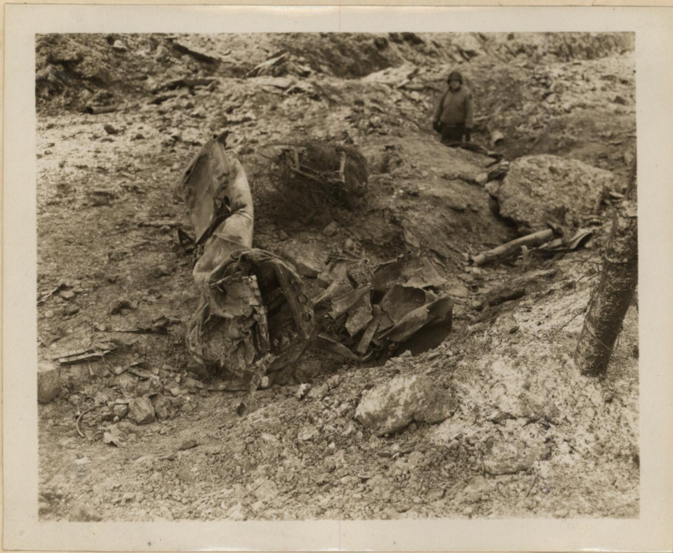
REMAINS OF V-1. CRATER IN BACKGROUND

6 of 6 sheets to Inclosure No. 5, AFTER ACTION REPORT December, 1944