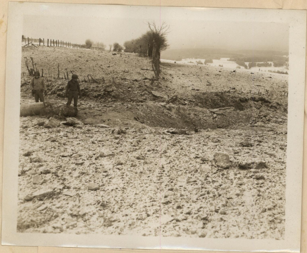
ROAD CRATERED 31 DECEMBER AT K-745093 BY V-1, BUZZ-BOMB.