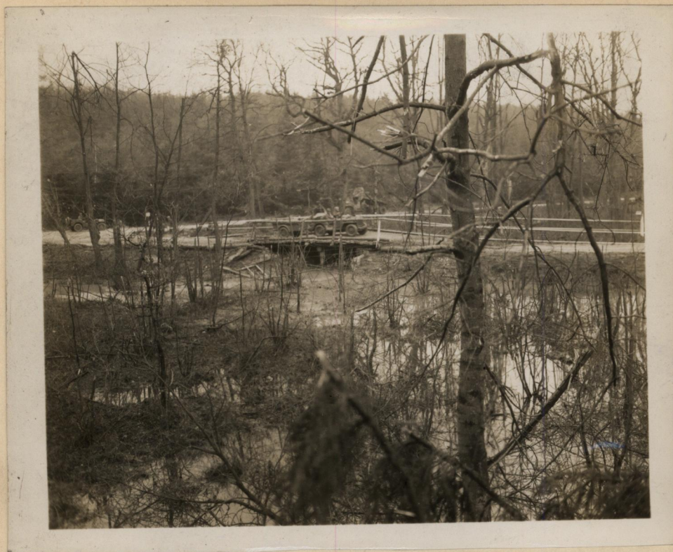
ONE-WAY ROAD TO HURTGEN - LOG-TRESTLE BRIDGE CLASS 40 - CONSTRUCTED BY "C" COMPANY AT NIGHT TO REPLACE M-2 TREADWAY.