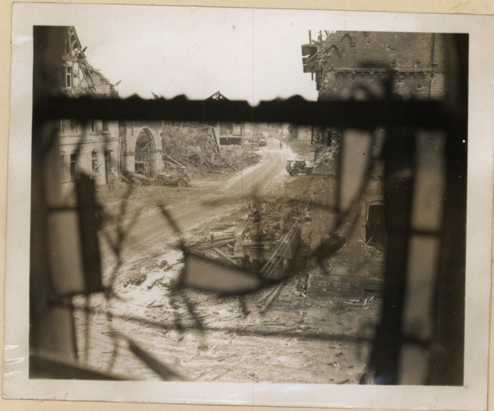
HURTGEN: CLEARANCE OF RUBBLE AND OPENING OF DRAINAGE ASSIGNED TO "C" COMPANY.

Sheet 4 of 6 sheets to Inclosure No. 5, AFTER ACTION REPORT December, 1944