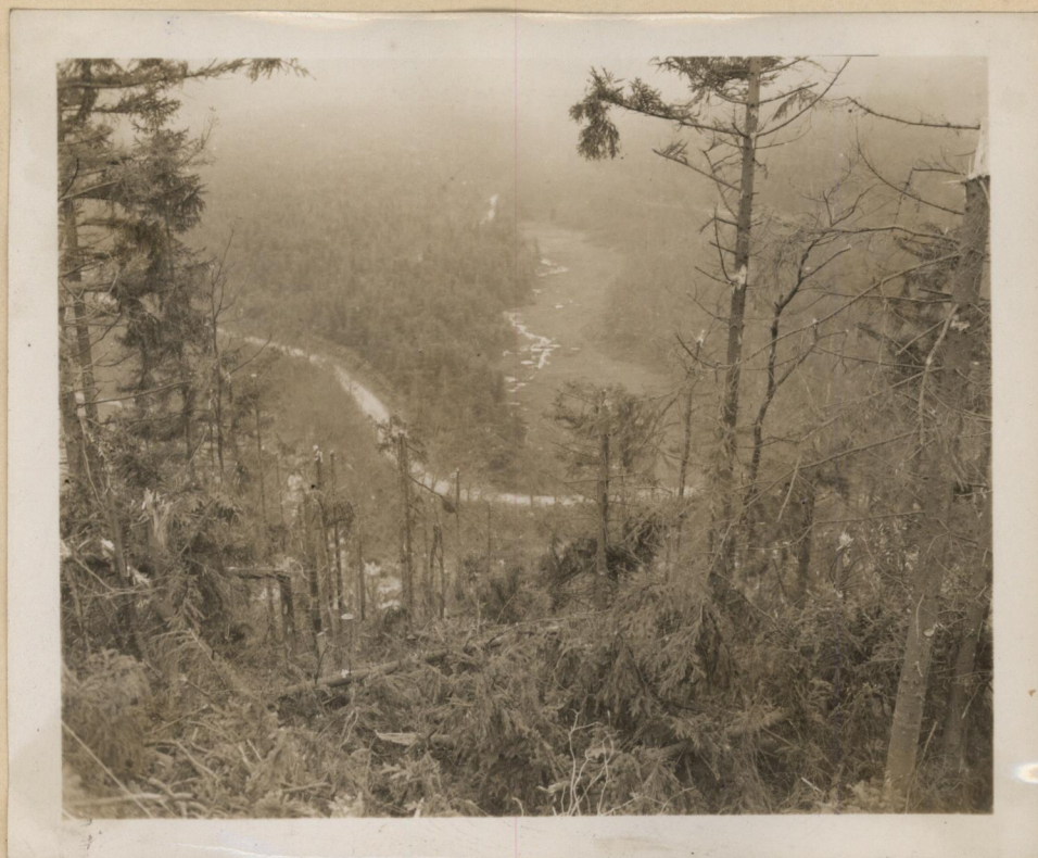
SCENE ALONG ROAD TO HURTGEN BEHIND THE 8TH DIV.

Sheet 1 of 6 sheets to Inclosure No. 5, AFTER ACTION REPORT December, 1944