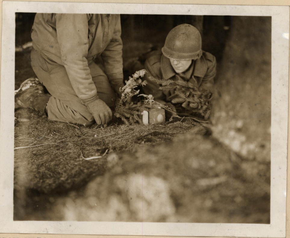
AMERICAN M-3's WERE STAKED AND WIRED DOWN AND CAMOUFLAGED.

Sheet 5 of 6 sheets to Inclosure No. 5, AFTER ACTION REPORT December, 1944